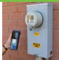
Automatic Meter Reading